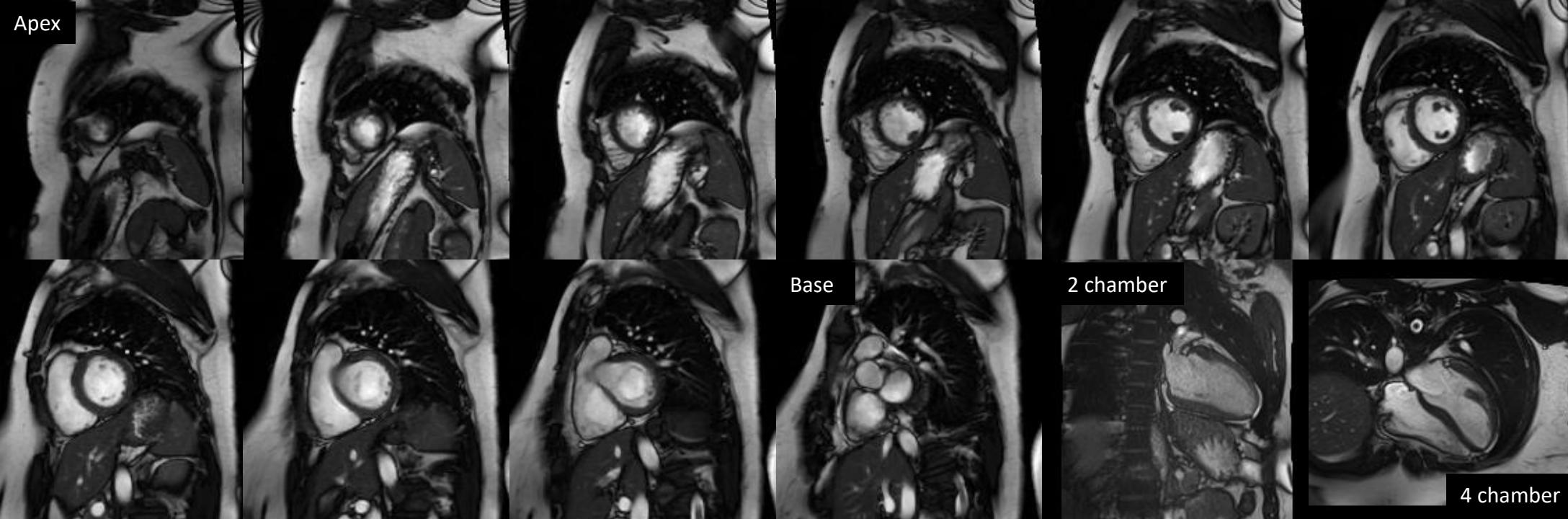
2D Standard Diastolic