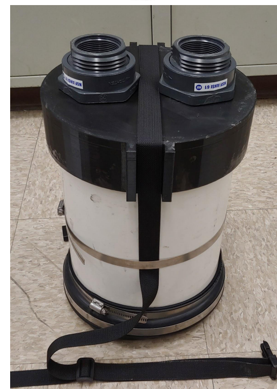
F: Section of 8" nominal PVC pipe G: Neoprene rubber sheet